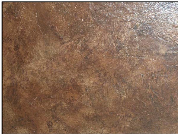
Detail of the faux leather look

Step 12 Apply two coats of Gloss varnish. I like Min-wax. For your final coat mix a light glaze of gloss varnish with a little burnt umber paint and varnish your surface, this gives your luggage labels a just off the train 1940's vintage look. I went back over the letters with a little more staz-on after the first coat of varnish.